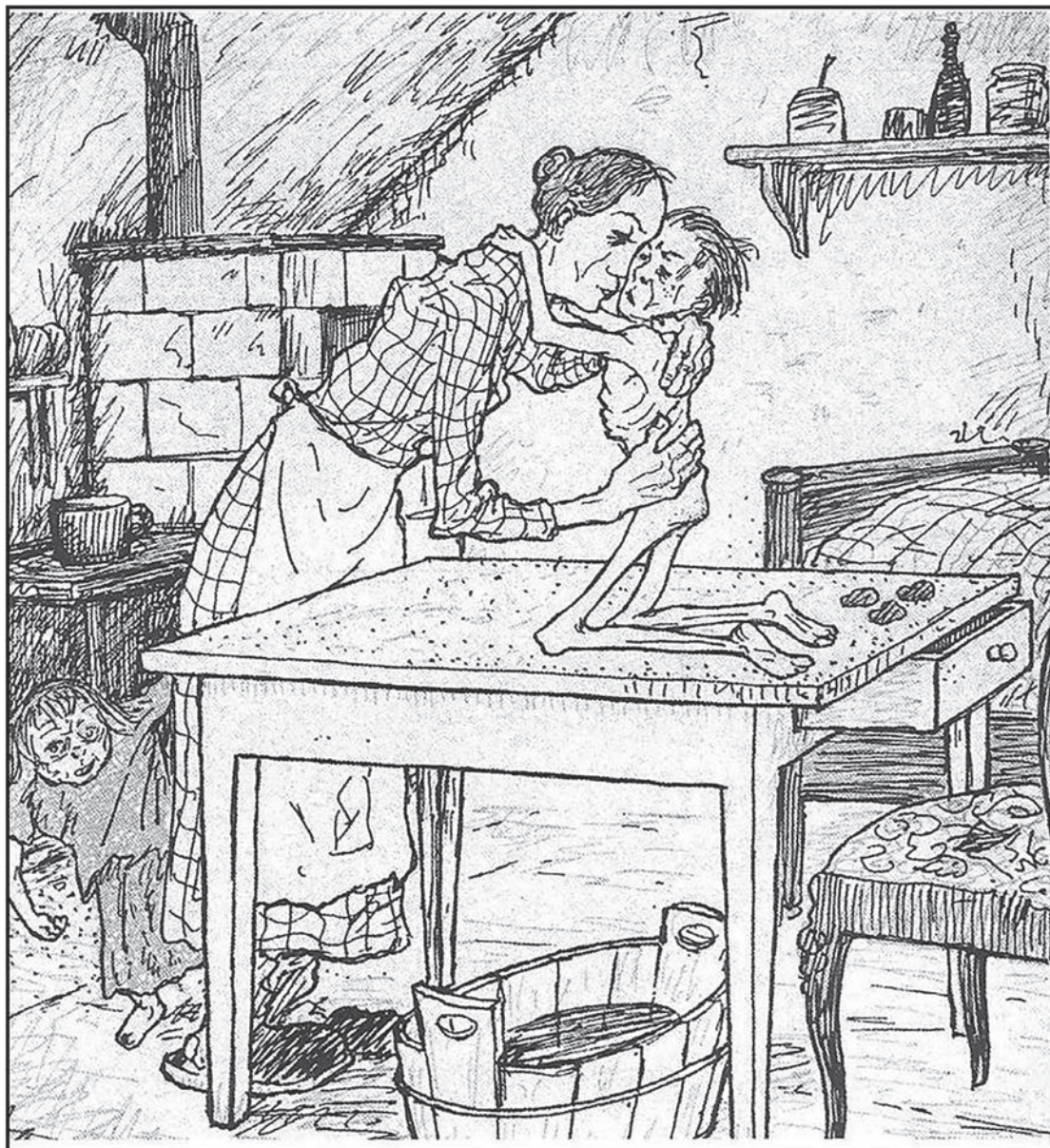
A cartoon entitled 'Consolation' published in a German magazine, 24 June 1919. The mother is saying to her child, 'When we have paid 100,000,000,000 marks, then I shall be able to give you something to eat.'